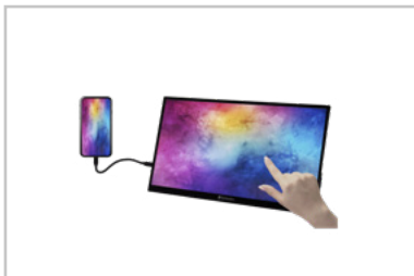
Monitor with smartphone