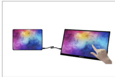
Monitor with tablet