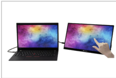
Monitor with laptop