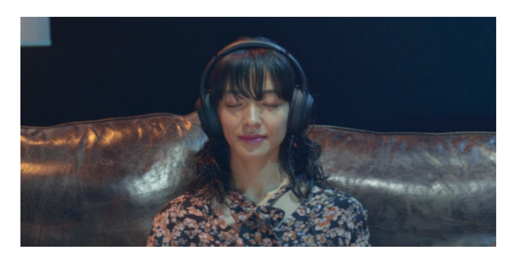
Enjoy Sony's audio technology, when you're either using headphones or the built-in Full-stage stereo speakers. You can even use the Xperia 1 IV to record music with professional sound using new Music Pro.<sup>9</sup>