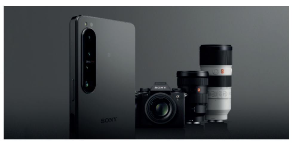
Our first smartphone capable of recording 4K HDR 120fps video on all rear lenses<sup>-3</sup>, with Eye AF and Object tracking technologies, and live video streaming.