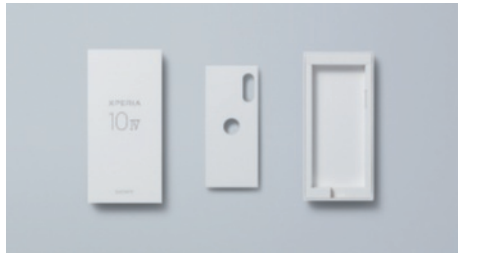
As part of Sony's sustainability drive, the packaging for the Xperia 1 IV uses no plastic, with these components either eliminated or replaced with paper materials.